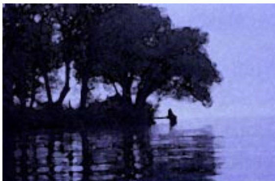
The island point in Rips

Rips is set on an island on the St. Lawrence River on the border of the U.S. and Canada during the French and Indian War.